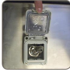
The key switch is placed in a watertight box.

All electronic parts and the motor have watertight casings.