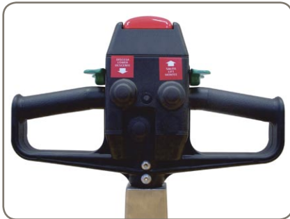
Central location of all control buttons.