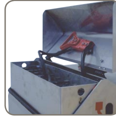
The batteries are placed in a holder - easy and quickly to exchange.