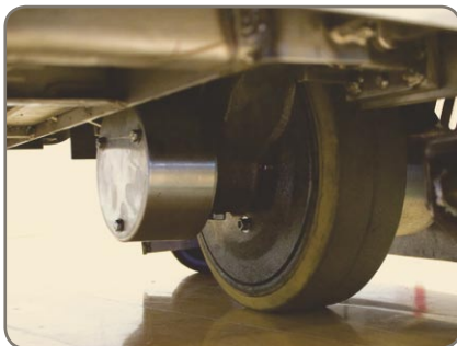
The stainless propulsion motor manages aggressive and wet environments down to -30°.